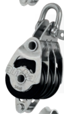
MOD. 00306 TRIPLE BECKET WEIGHT – 102 g SWL – 600 kg