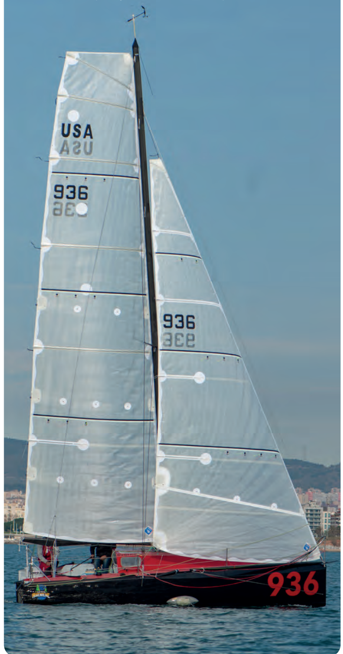
Mini650 Proto, Speedy Gonzales – J. Thompson

SIZE – 40×8 WEIGHT – (+)20 g MAX LOAD – 500 kg