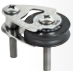
MOD. 00311 FOOT BLOCK WEIGHT* – 36 g • SWL – 400 kg SCREWS – 2×Ø6 mm (included)