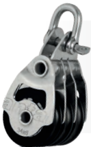
MOD. 00305 TRIPLE BLOCK WEIGHT – 94 g SWL – 600 kg