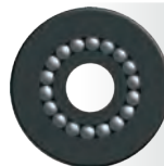
MOD. 03413M This sheave is supplied with models 00323 and 00324 . Ø – 34 mm LINE – 8 mm SWL – 400 kg