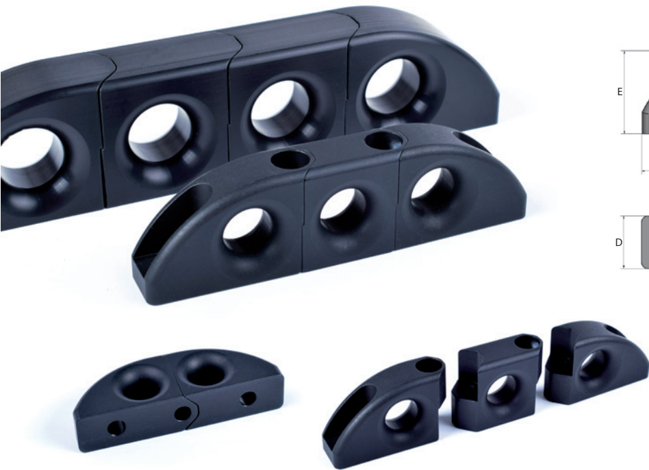
LOOP® Organizer 13-26, base brick with blind thread