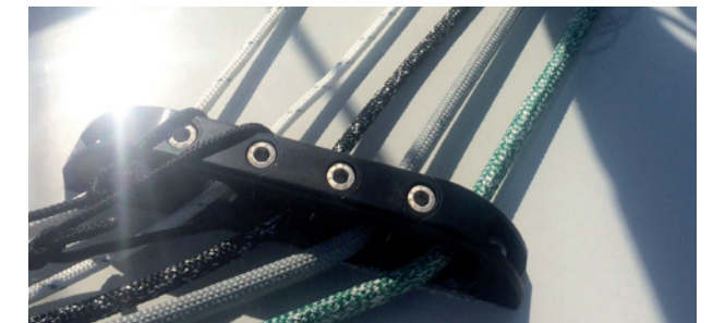
LO 18-26 as a triple version mounted on deck

Our KOHLHOFF LOOP® Organizer is available in two different sizes and any length you like!