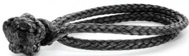
LOOP® Shackle Type 2