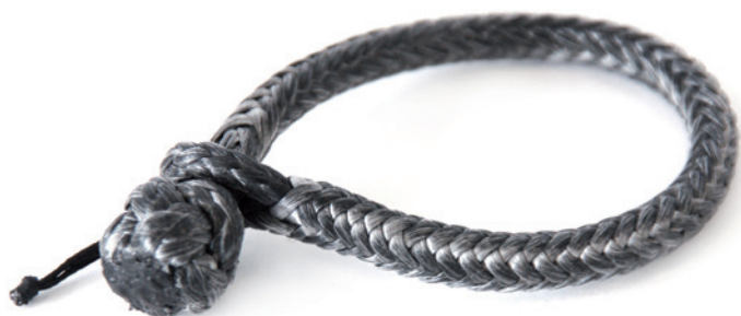
LOOP® Shackle Type 1