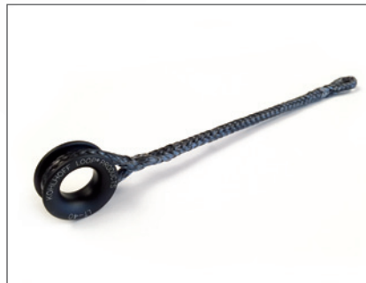
LOOP® Stropp combined with a LOOP® Thimble