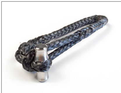
LOOP® Stropp combined with a LOOP® Dogbone.