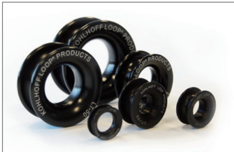
LOOP® Thimbles are available in 6 different sizes