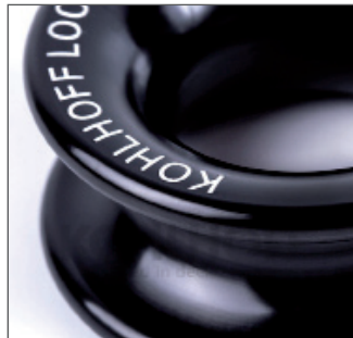
Milled out of aluminium and anodised