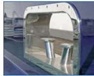
Special steel bracket in aluminium shell plate

TIKAL TEF-GEL is a watertight, PTFE-based paste which prevents the blooming of metal and also reliably prevents corrosion from galvanic flows between unequal metals. In all places where refined metals come into contact with less refined metals (eg. aluminium with special steel), a small amount of TIKAL TEF-GEL suffices to prevent galvanic exchange of electrons and subsequent corrosion.