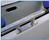
Special steel coating on aluminium hull