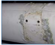
Corroded aluminium mast