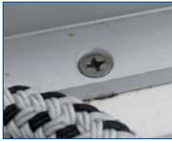
VA screw aluminium floor rail