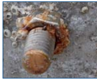
Corroded VA screw in aluminium