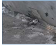
VA screw in aluminium welded seam