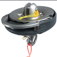
Drum with its fitting