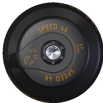
ENTREE CORDAGE LINE ENTRY